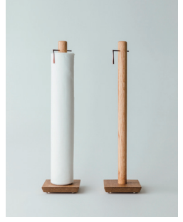
Wazarashi Roll Stand Vertical wazarashi roll stand

Wazarashi squares in a convenient size. The versatile cloth can be used in the kitchen and around the house for a range of tasks. Containing five cloths, this set is perfect for first-time users.