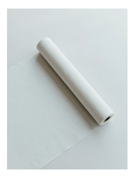
Wazarashi Roll - Free Unperforated

Wazarashi roll with no perforations, allowing you to cut to the size the task requires. The versatile cloth can be used in the kitchen and around the house for a range of tasks, whether it be wiping, wrapping, straining or covering. The crisp material is easy to wash and can be used over and over again.